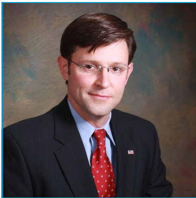
Congressman Mike Johnson

Elected in November 2016 Congressman Mike Johnson is a Republican member of Congress serving Louisiana's 4th District. He was appointed to the House Judiciary Committee and two of its subcommittees—the Subcommittee on Immigration and Border Security and the House Subcommittee on Crime, Terrorism, Homeland Security and Investigations. In addition, he is on the House Natural Resources Committee.